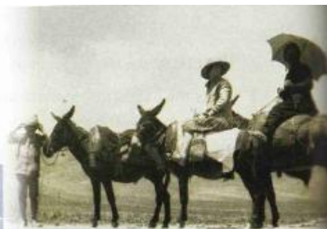
Freya Stark was a travel writer who spent much of her life travelling in the Middle East. While she was travelling , she was constantly taking notes and photographing places and people, so her travel books are very personal.

Spelling rules for -ing forms ➤ page 350