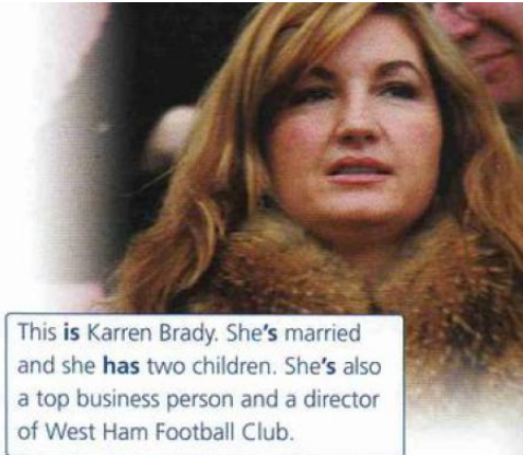
This is Karren Brady. She 's married and she has two children. She 's also a top business person and a director of West Ham Football Club.

NATURAL ENGLISH In speech and informal writing, we usually use short forms e.g. I'm, she's, he isn't, we aren't . For negative questions with I am , we use aren't I : Why aren't I on the list?