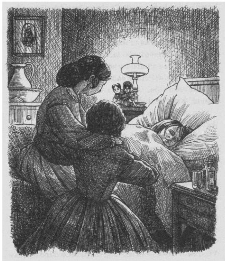
Meg and Jo held each other close.

Hannah made breakfast while Meg and Jo listened as their mother told them about their father's health, and Mr. Brooke's promise to stay with him. Then Meg and Jo closed their tired eyes and were able to rest at last.