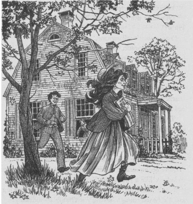
Meg saw Laurie chasing Jo all over the garden.

‘What can we do with that girl?’ said Meg. ‘She never will behave like a young lady.’