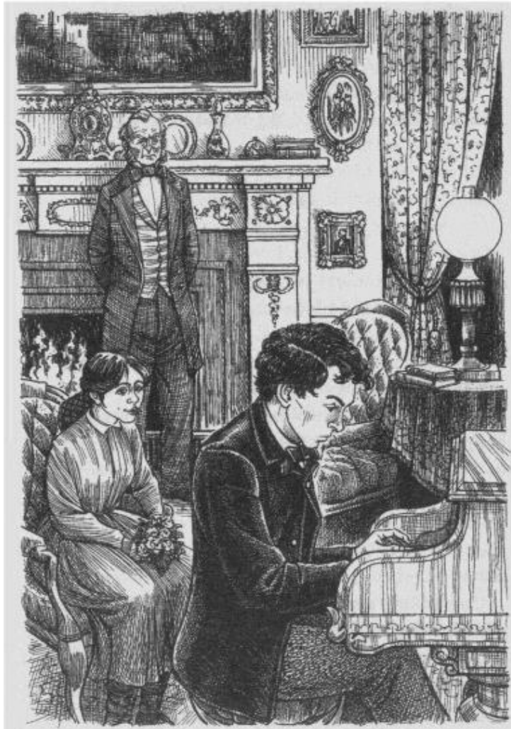
Laurie played and Jo listened.

Laurie's father married an Italian lady, a musician, 'said Mrs. March. 'The old man didn't like her, and never saw his son after they were married. Laurie was born in Italy, but his parents died when he was a child, and his grandfather brought him home. Laurie loves music and I expect his grandfather is afraid he'll want to be a musician like his mother.'