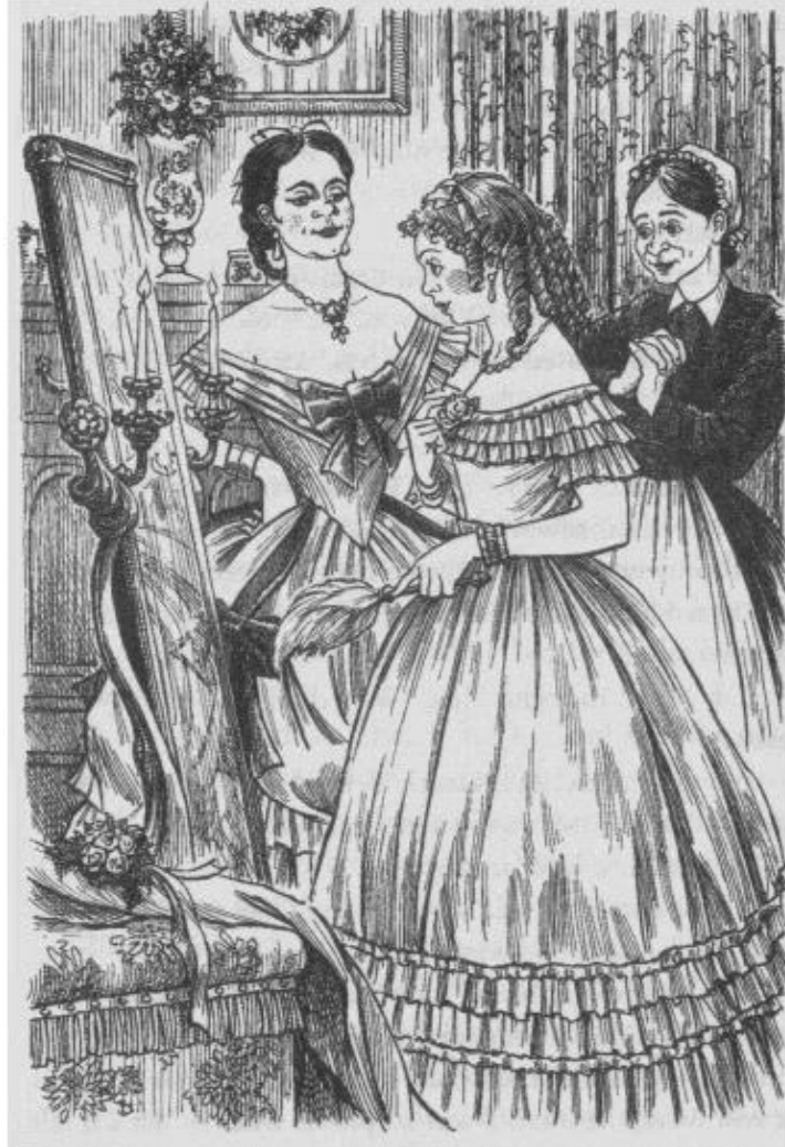
Meg was ready for the party.

At first, she felt strange in all the fine clothes, but she soon discovered that people who did not usually notice her now came to speak to her. Several young men who had only stared before now asked to be introduced.