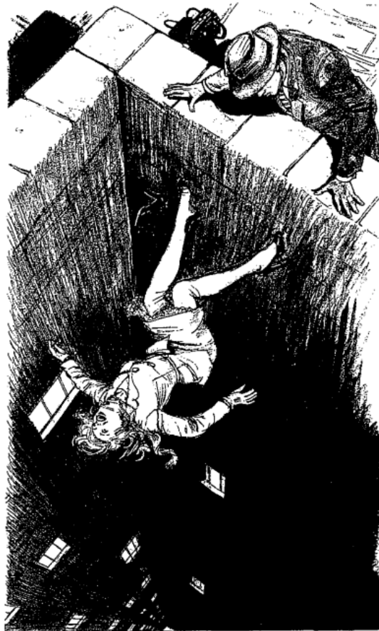
She fell backwards off the wall into the air shaft.

The young man was already running towards the iron door when he heard Dorothy's body hit the bottom of the shaft. Three minutes later, he was in the street. He was walking slowly away from the Municipal Building. After another minute, he saw an ambulance going towards the building.