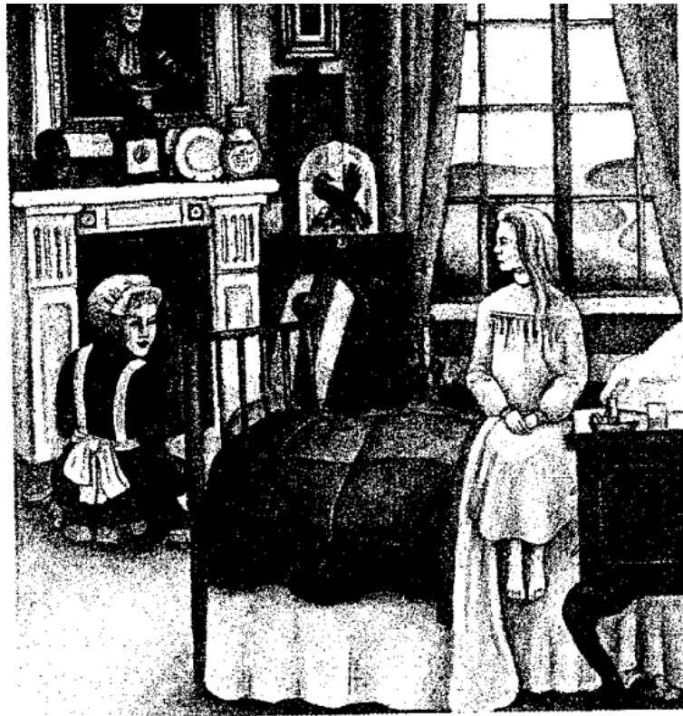
Martha stopped cleaning, and stared at Mary.

Little Miss Mary was furious with Martha. 'It's different in India where I come from! You don't know anything about India, or about servants, or about anything! You . . . y o u . . . ' She could not explain what she meant. Suddenly she felt very confused and lonely. She threw herself down on the bed and started crying wildly.