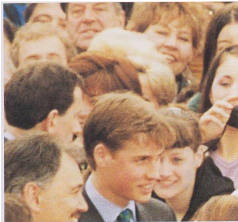
William talks to one or two of the girls.

He loves Highgrove House, and he goes there at weekends and in the school holidays. It is quiet there. There are no reporters, and no photographers. He and Harry play football in the gardens. They swim at Highgrove, too. There are pictures of sports men and women in their bedrooms.