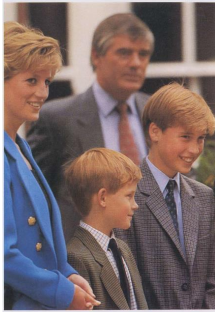
William on his first day at Eton.

Early in the morning of 31 August 1997, Princess Diana comes out of the Ritz Hotel in Paris with Dodi Fayed. A short time later, they are dead, in a car accident. Princess Diana is only thirty-six years old.