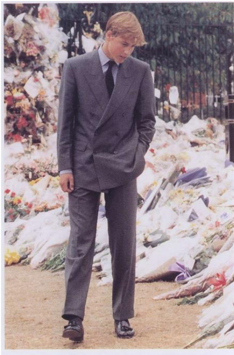
William looks at the thousands of flowers near Kensington Palace.

William and Harry go to church with their father later that morning. Newspaper and television reporters and a small number of people watch quietly.