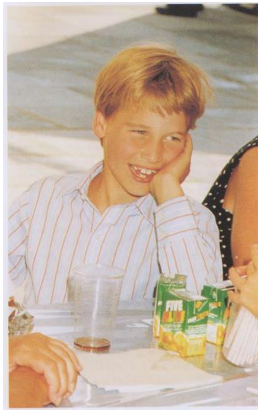
William at the age of nine.

Prince Charles and Princess Diana do not live in the same house. Charles lives in his country home at Highgrove House. William visits him there. He likes Highgrove, and he loves his father. But it is a difficult time for him. William likes watching television.