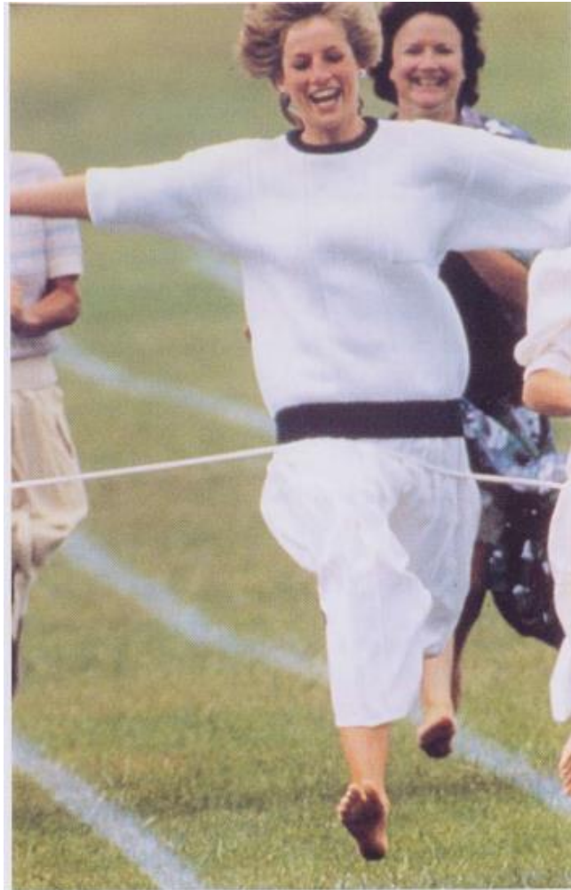
Princess Diana in a game for mothers.

It is June 1991, and William is playing golf with his friends at Ludgrove. Suddenly, there is an accident. A friend hits him on the head. The school sends William to a hospital in Reading.