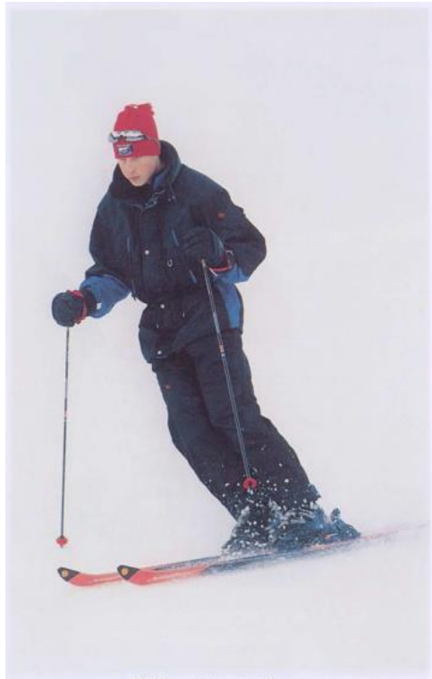
William skiing in Klosters.

'You can't,' says Harry. 'You're going to be king.' William does not want to think about this.