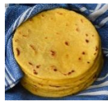
Corn flour chapattis

Seeing the saag, he said, "I wish yummy makki dia rotia (the chapattis of corn flour).