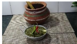
A dish of saag

Chappan agreed and went home. He told his wife about the wishes. Tauri became happy and went to the kitchen. She brought food for her husband. It was a dish of mustard greens (saag) and the chapattis of wheat. She did not know how to make the chapattis of corn.