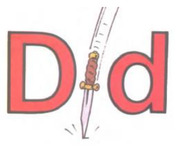
dagger A kind of knife used for fighting. (ইন্ব) কटাই; স্তুরা.