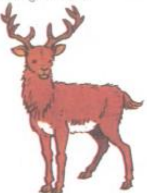
deer A wild animal. A deer has horns (डियर) and is very shy. मृग, हिरण.