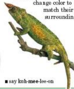
■ say kuh-mee-lee-on

chameleons noun a type of lizard that lives in trees in hot regions and eats insects, rodents, and small birds. Chameleons can change color to match their surroundings.