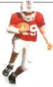
playing football playing American football