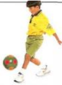
playing soccer playing football