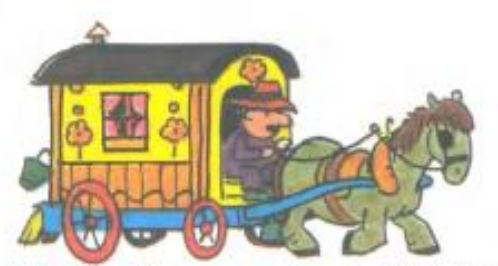
caravan A house on wheels. झॉपड़ी जैसी (कैरेंवन) बड़ी घोडा-गाडी.