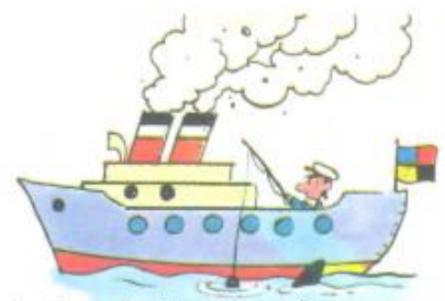
boat A small ship. A boat floats on (बोट) water. नाव; किश्ती.